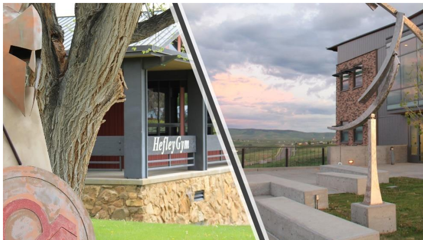
Figure 1-Dual focus picture of Rangely and Craig Campuses