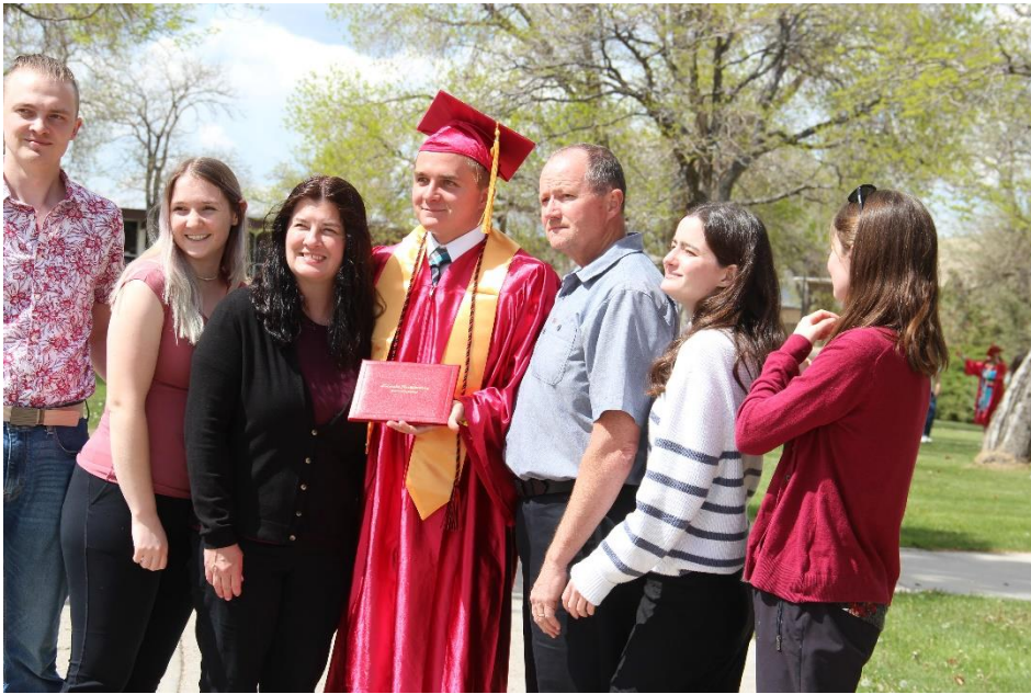
Image 5: Students celebrate with their family and friends post-graduation.