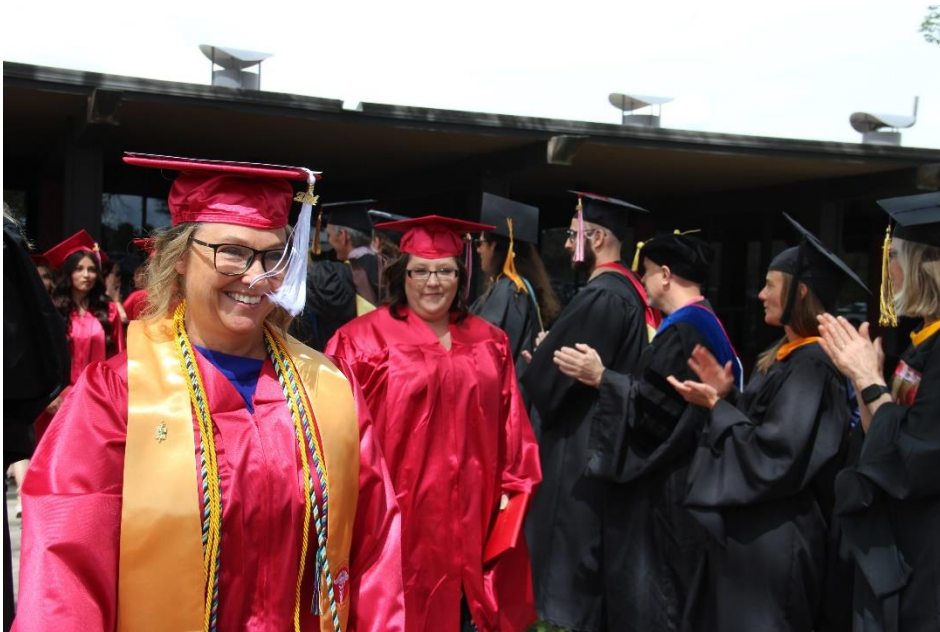
Image 4: Post-graduation ceremony, students walked through the faculty gauntlet for celebration and recognition.