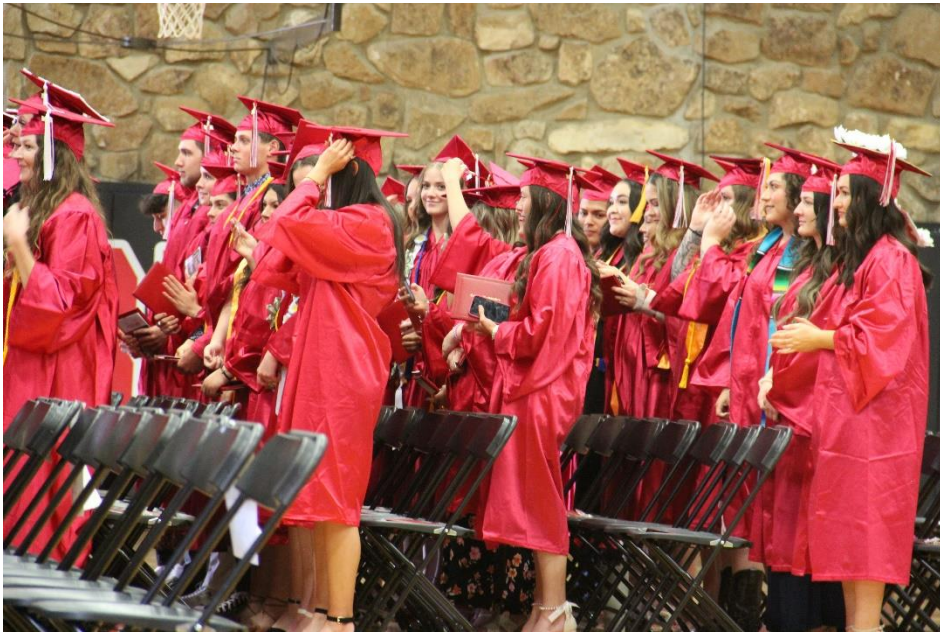
Image 3: Students turn their tassels in recognition of their achievements of becoming a CNCC graduate.